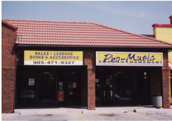
The first Pro-Music school established in 1998.