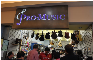
The Pro-Music retail store at First Markham Place.