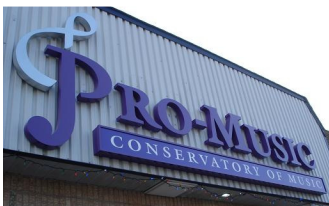
In 2006, the main Pro-Music school in Markham expanded and moved to a 6000 square feet unit.